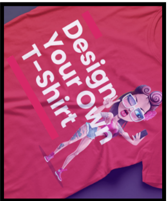
APRIL 7 MAKE YOUR OWN T-SHIRT