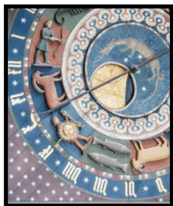
NOVEMBER 3 ASTROLOGY ZODIAC