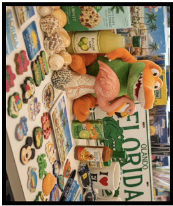
AUGUST 4 SOUVENIRS FROM FLORIDA