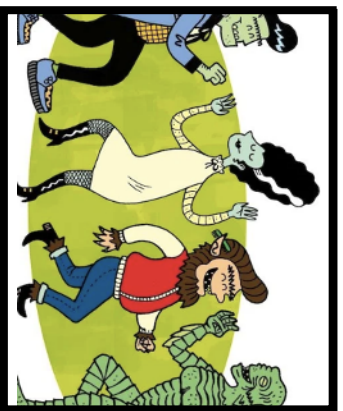
OCTOBER 6 MONSTER MASH