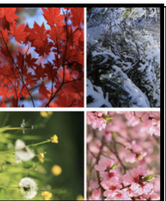
SEPTEMBER 1 FOUR SEASONS