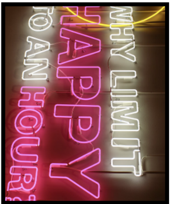
JANUARY 6 HAPPY HOUR