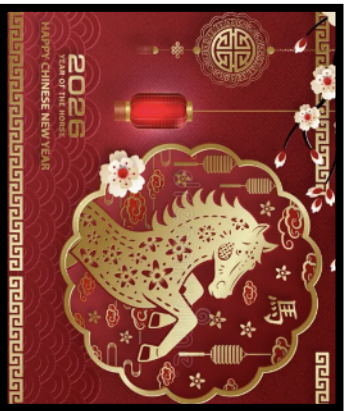
FEBRUARY 3 CHINESE NEW YEAR