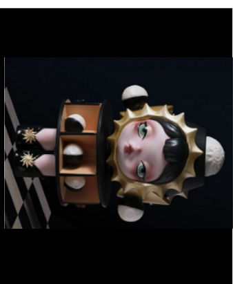
DECEMBER 1 TOYS, VIDEO GAMES, NERDFEST