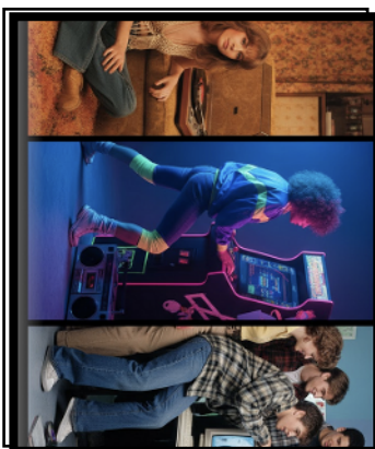
JULY 7 70'S, 80'S, 90'S